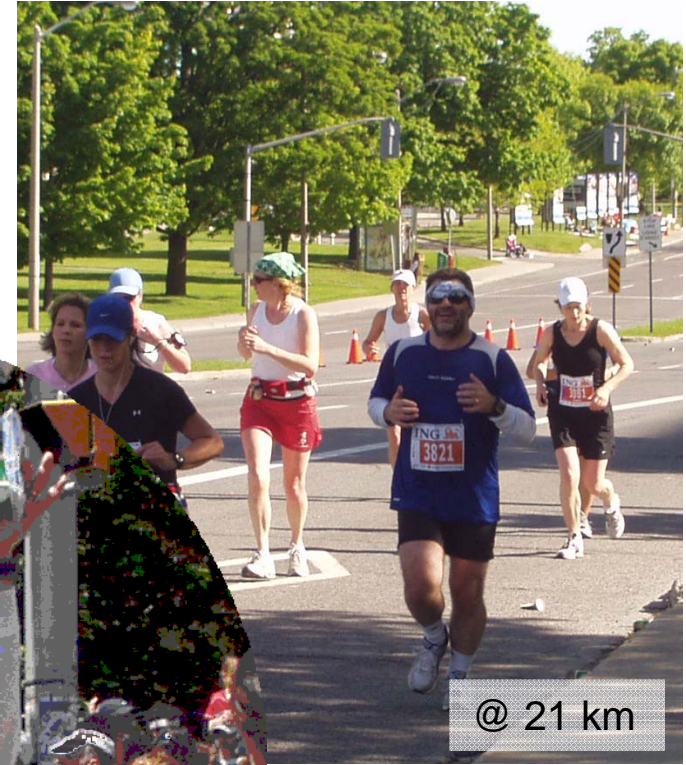
@ 21 km