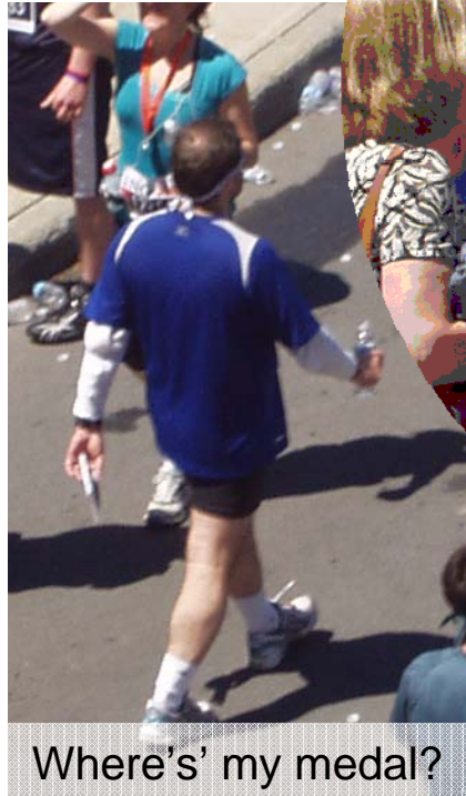
Where's' my medal?