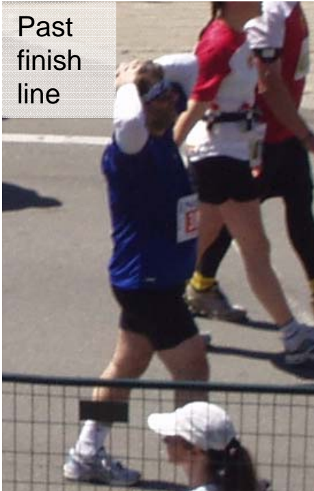
Past finish line